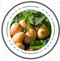
≡ Irish potatoes