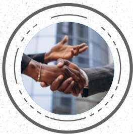
Turikumwe Life Product

This product is tailor made to cover low-income segment against losses arising –of accidental death, funeral benefit in case of natural death, and a hospital cash in case of hospitalization due to illness or by an accident during the term of cover.