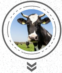
Milking Cattle & Heifers

RADIANT YACU LTD indemnify the insured subject to the limit of indemnity in respect to the insured's livestock during the period of insurance due to the because of: Accident (lightning, internal and external injuries, snake bites, flooding, and landslide. Emergency slaughter on advice of a qualified veterinary surgeon /practitioner, Epidemics, The policy cover: indigenous, cross bred and exotic cattle, pigs, and Chicken.