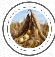
≡ Soya beans