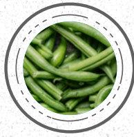
≡ French Beans