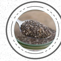
≡ CHIA SEEDS